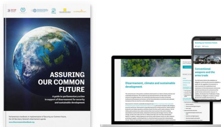
Assuring our Common Future , A handbook for parliamentarians on disarmament for security and sustainable development, is available in English, French and Spanish online (formatted for web, tablet and smartphone) and in PDF formats.

BPO has also been active in regional and global initiatives to reduce nuclear risks in the Russia/Ukraine war and in other nuclear flashpoints including North-East Asia and India/Pakistan, and in promoting the peace and security of a nuclear-weapon-free world. BPO hosts the web platforms for a number of coalitions and cooperative projects including Abolition 2000 , Move the Nuclear Weapons Money , NoFirstUse Global , Parliamentarians for Nuclear Non-proliferation and Disarmament and UNFOLD ZERO platform. During 2023 we produced and published the E-Newsletters for these coalitions/platforms and organized representation for them at key UN events relating to nuclear disarmament including the UN Conference on Disarmament (Geneva), Non-Proliferation Treaty Review Conference (Vienna) and the UN General Assembly (New York).