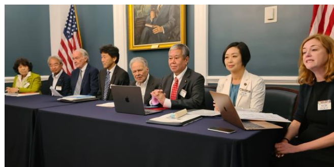
Senator Markey (3 rd from left) hosting the meeting of 3+3 Delegation with US legislators in Capitol Building in September, 2023.