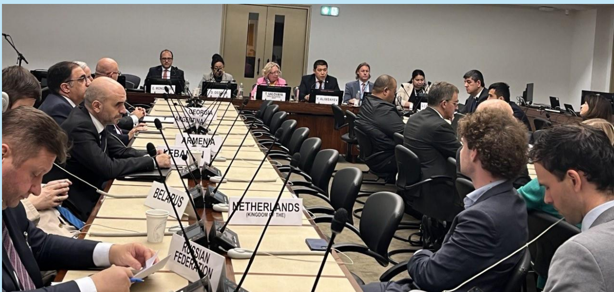
Photo: Event at the Palais de Nations in Geneva to commemorate the International Day Against Nuclear Tests and the 75 th anniversary of the UN Declaration of Human Rights.