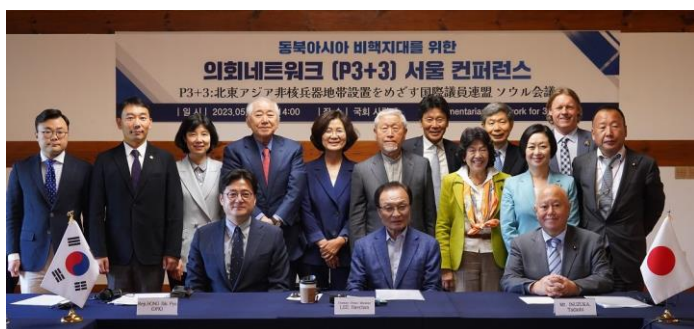
Basel Peace Office Director Alyn Ware was one of the Speakers of the 3+3 NE Asia NWFZ conference in the Korean National Assembly in April, 2023