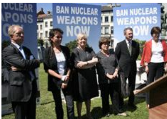
Members of the European Parliament launch the parliamentary Statement supporting a Nuclear Weapons Convention

The Declaration was endorsed by parliamentarians from around the world– including current and former heads of government, chairs of key committees and others. It was presented to UN Secretary-General Ban Ki-moon at a special PNND strategy meeting with him in October 2009. As a result, Mr Ban took the unprecedented action of contacting the speakers/presidents of every parliament in the world to commend such parliamentary action and encourage further action.