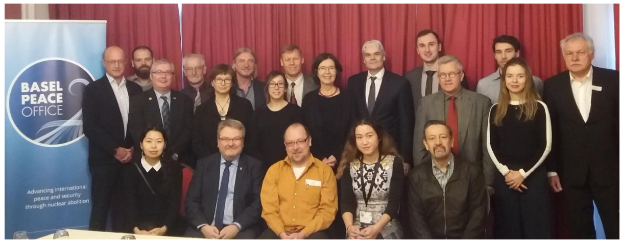
Joint meeting of mayors, parliamentarians and disarmament experts, Basel January 14, 2019

We organized a number of events in Switzerland (Basel and Geneva), as well as global actions and campaigns. We also organised (or co-organised) events in Belgrade, Canberra, Dhaka, Dublin, Edinburgh, London, Luxembourg, New York, Prague, PyeongChang (South Korea), Vienna, Washington DC and Wellington (New Zealand).