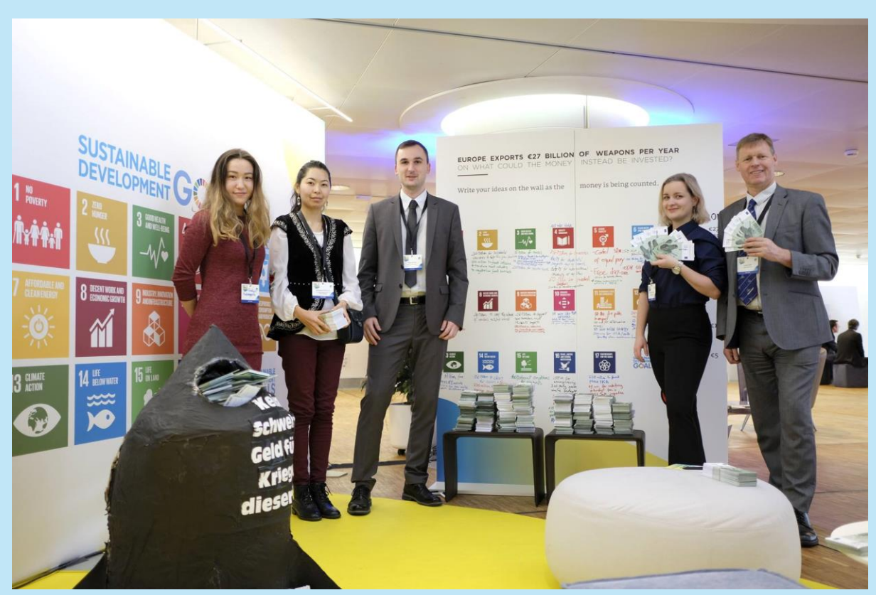
Basel Peace Office pavilion at the Basel Peace Forum