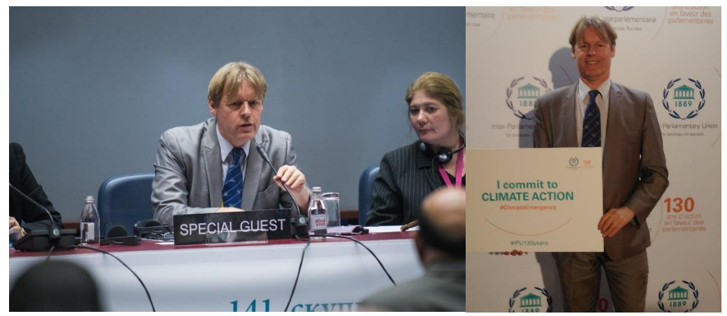
BPO Director Alyn Ware chairs the IPU session on the Role of Parliamentarians to achieve a nuclear weapons-free world, and then speaks on climate action and nuclear disarmament in the plenary session.

BPO and PNND engaged parliamentarians in nuclear disarmament during 2019 through a number of actions and events including the Basel Appeal (mentioned above), advocacy at the OSCE Parliamentary Assembly in Luxembourg (see OSCE Parliamentary Assembly advances peace, disarmament and sustainable development) and at the IPU Assembly in Belgrade (see Ending investments in nuclear weapons and fossil fuel industries), through actions and events to support the Korean peace and denuclearization process (see Parliamentarians and civil society call for progress at USA/DPRK Summit) and through the Move the Nuclear Weapons Money campaign (see below).