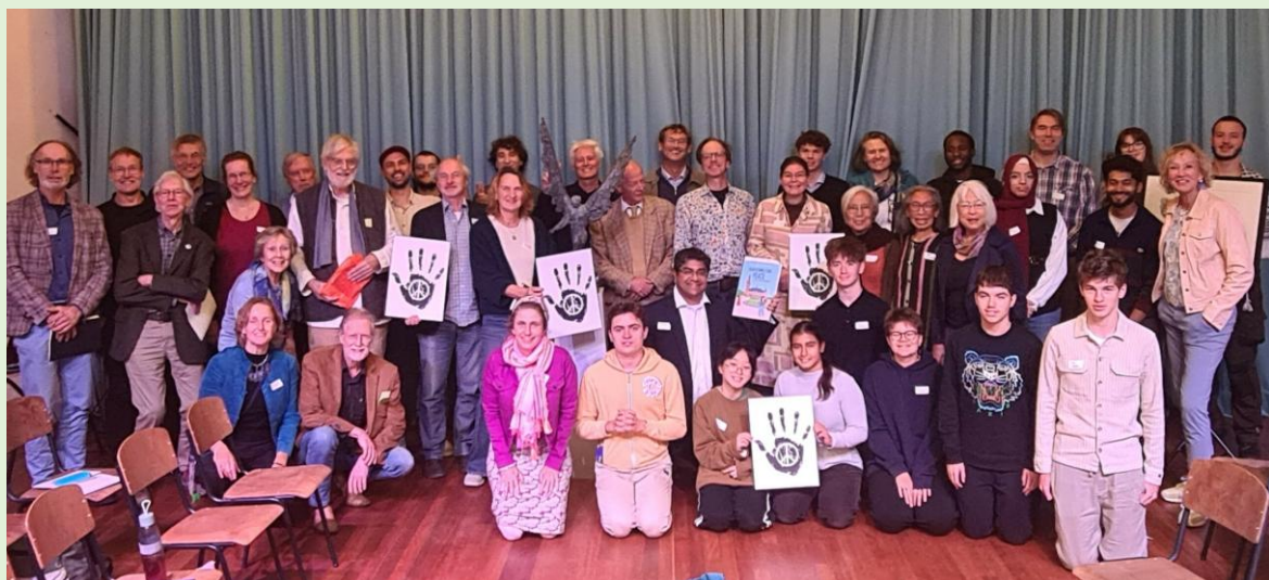
Participants at the Hague Conference on Future Generations and Eco-Peace . Basel Peace Office led the drafting of the Hague Appeal for Future Generations: Action now to secure Peace and protect the Future , which includes 15 action calls to secure peace with our natural environment, protect current and future generations, advance justice, and shape a positive future. The Appeal and was circulated to UN Members on October 24, UN Day.