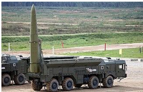
Iskander-M short-range nuclear missile on the starboard erector arm of the 9P78-1 transporter erector launcher. Russia has transferred an undisclosed number of these to Belarus. The warheads have yields between 5 and 50 kilotons. In comparison, the yield of the Hiroshima bomb was 15 kilotons.

Excerpt from our submission to the UN Human Rights Council on Belarus nuclear weapons policy and practice.