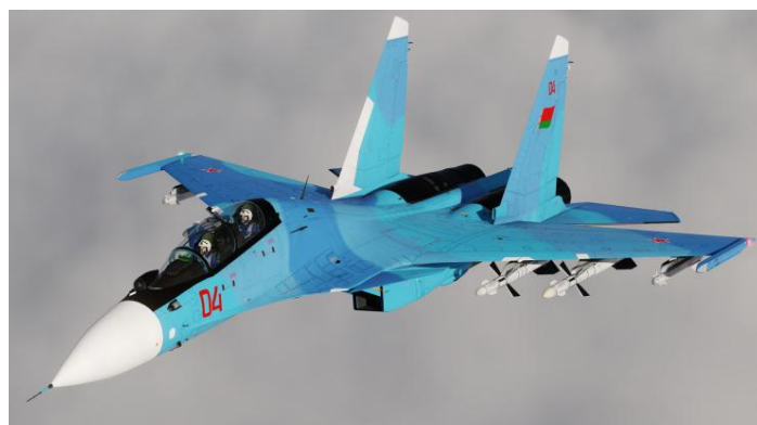
One of the SU-30 fighter-attack planes in the Belarussian airforce. Russia has transferred an undisclosed number of free-fall nuclear bombs that can be delivered by the SU-30. These have a yield of 15-20 kilotons.