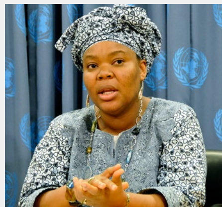
Leymah Gbowee.

Women of religious and faith-based communities can meet together to discuss their role and develop actions to educate others and achieve a nuclear weapon-free world.