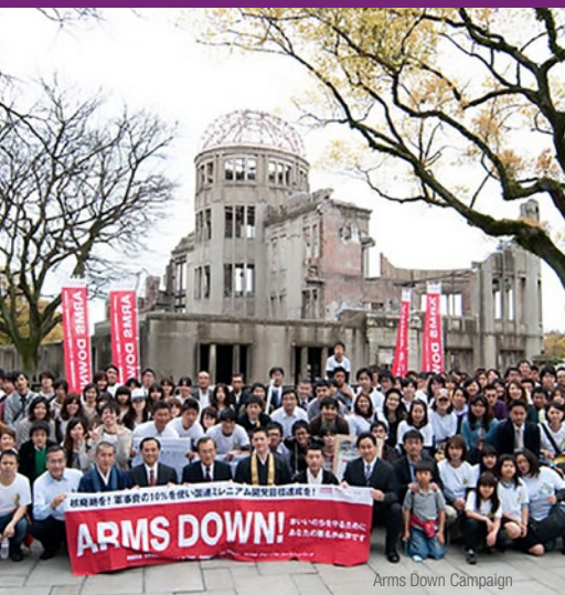
Arms Down Campaign

Religions for Peace Youth gathered over 21 million signatures for the appeal to abolish nuclear weapons, reduce military spending by 10 percent and use these funds to implement the UN Millennium Development Goals.