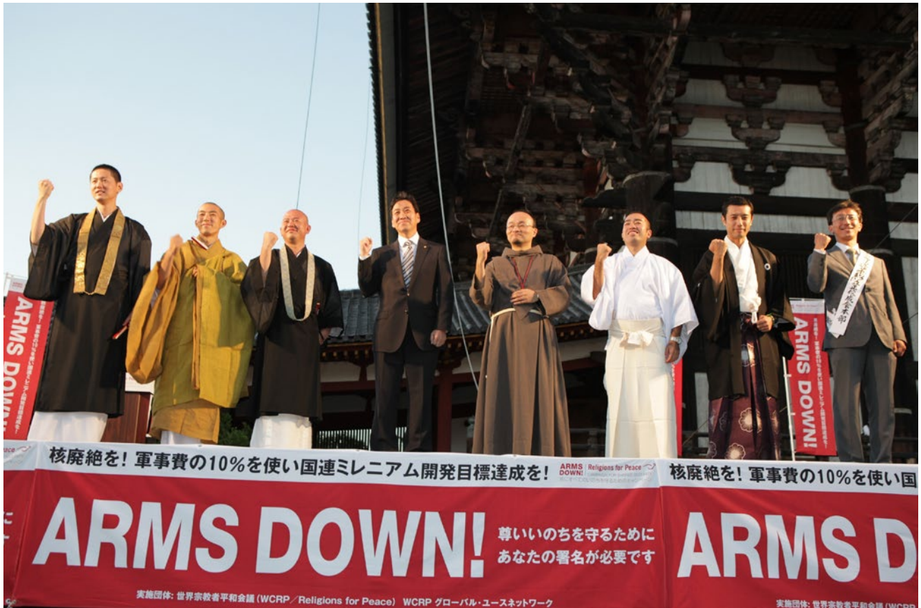
Religious youth leaders in Japan celebrating the success of the Arms Down! Campaign in Todaiji Temple, Nara, Japan.