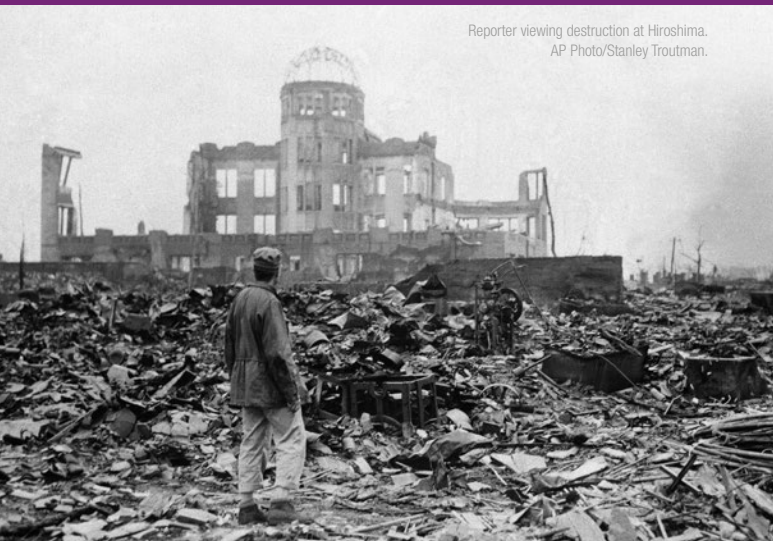
Reporter viewing destruction at Hiroshima.