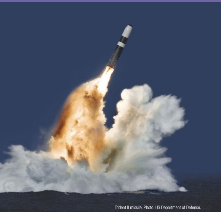
Trident II missile.