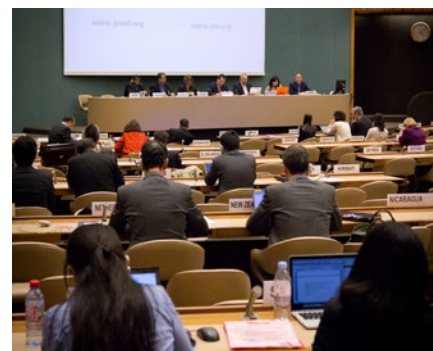
OEWG held its meeting in Geneva for 15 working days spread across May, June and August 2013.

Parliaments and legislators – both local and national – have been especially supportive. The US Conference of Mayors in June 2013 adopted a resolution calling on the US Government to participate in good faith in the OEWG. The Parliamentary Assembly of the Organisation for Security and Cooperation in Europe welcomed the OEWG in its 2012 annual resolution that was adopted by consensus by all 56 parliamentary delegations including from four nuclear-armed states. The Inter-Parliamentary Union included the OEWG among the key issues discussed in the preparatory process for a declaration for a world without nuclear weapons to be adopted next year. Leaders of the international network of Parliamentarians for Nuclear Non-Proliferation and Disarmament commended the success of the OEWG and called for continuation of the process in letters to UN ambassadors.