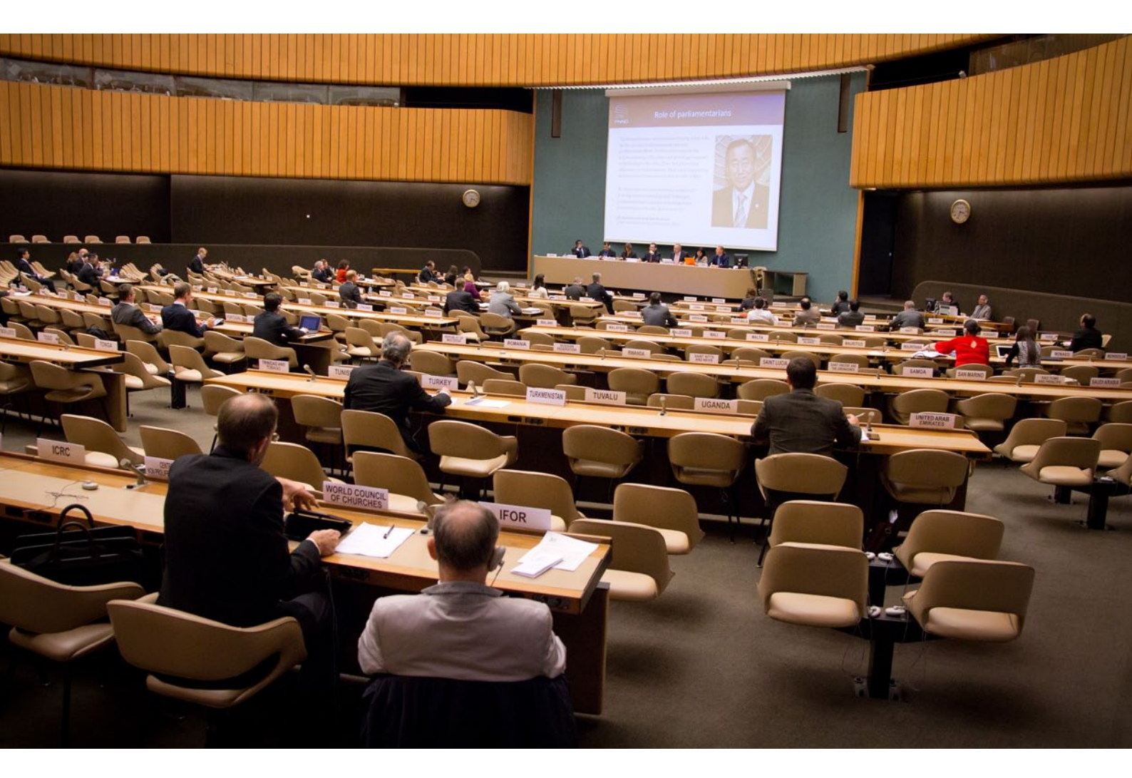
OEWG session on the Role of Parliamentarians, May 23, 2013.

The working group is required to submit to the sixtyeighth session of the UNGA a report on its work, "reflecting the discussions held and all proposals made" and the resulting proposals it has collectively developed. The resolution noted that the GA will assess the work of the OEWG "taking into account developments in other relevant forums" which means that progress in the Conference on Disarmament could be regarded as a positive development. Furthermore, the Secretary-General is requested to transmit the report of the group to the CD and the Disarmament Commission.