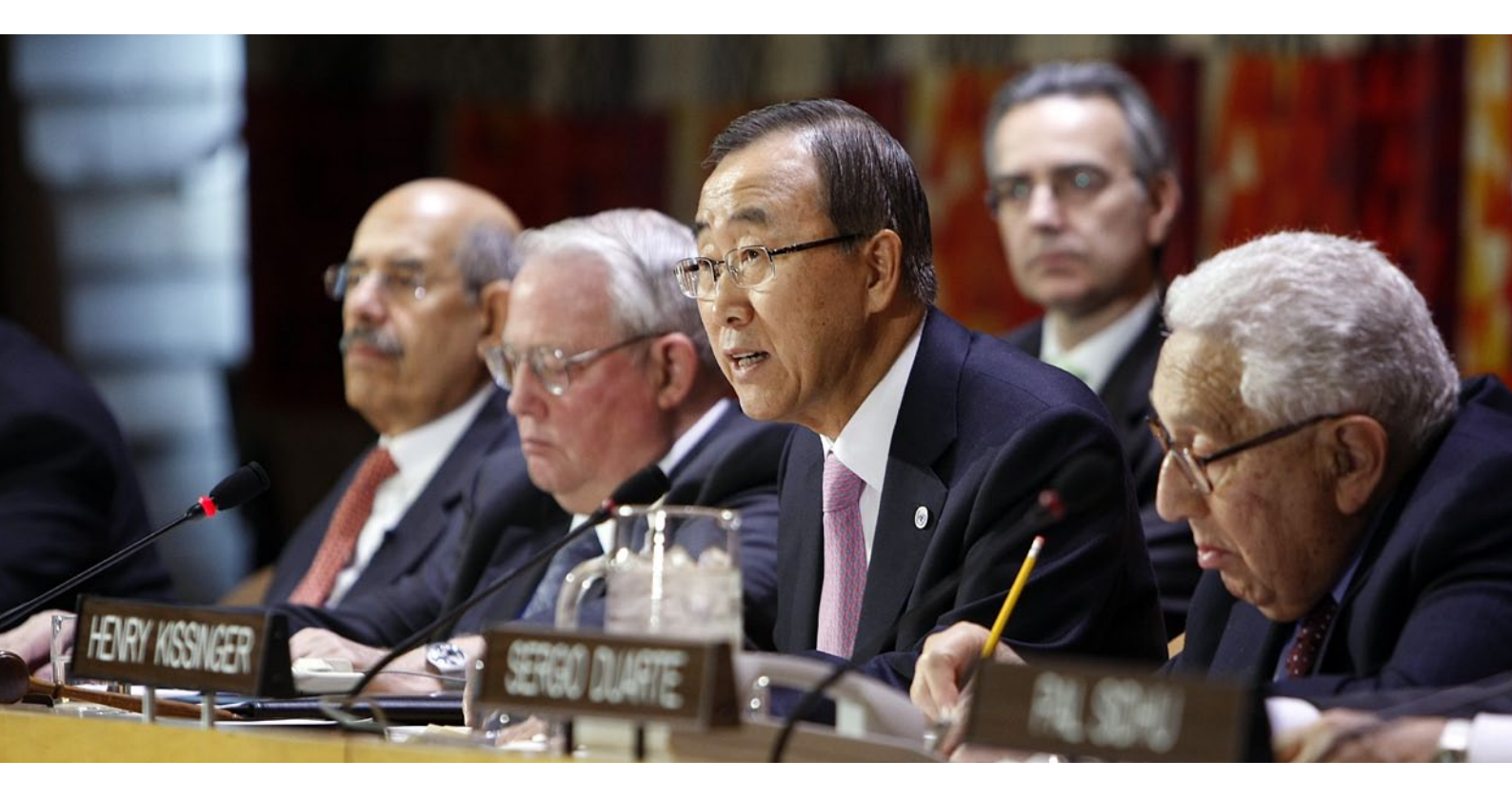
UNSG Ban Ki-moon releasing his 5-point plan at the UN General Assembly.

The incremental-comprehensive approach requires engagement with the NWS, but also provides possibilities for non-NWS to commence preparatory work on elements of a nuclear weapons free world, or even pre-negotiations taking place prior to the NWS agreeing to join the process. The OEWG could commence such work, at the same time as reaching out to the NWS to seek their engagement (See Appendix F: Proposals to the OEWG).